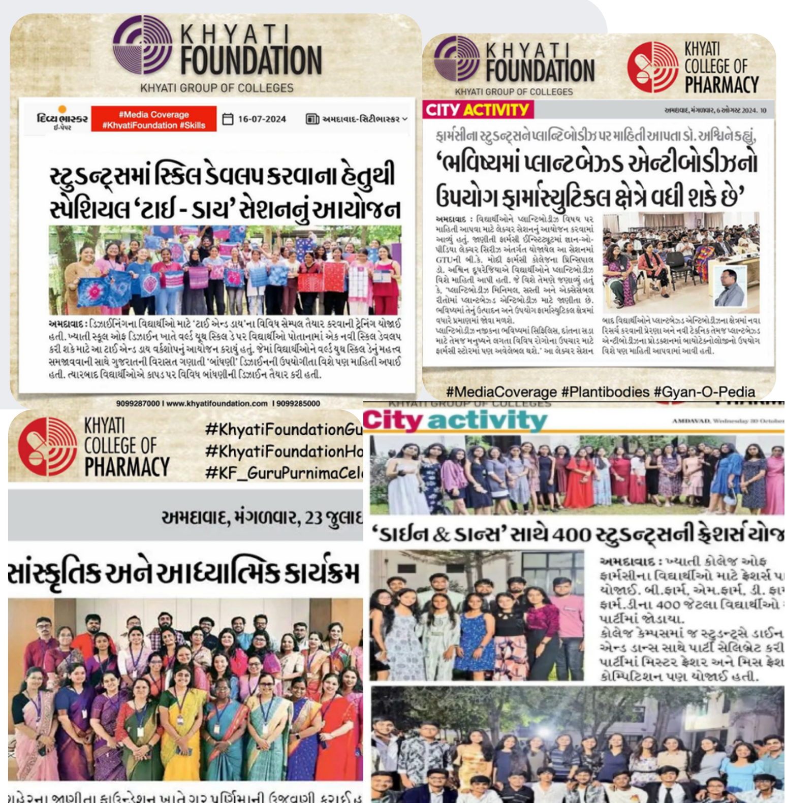
શહેરના જાણીતા ફાઉન્ડેશન ખાતે ગુરુ પૂર્ણિમાની ઉજવણી કરાઈ હ સાંસ્કૃતિક અને આધ્યાત્મિક કાર્યક્રમ યોજાયા હતાં. જેમાં ફેકલ્ટી દ્વાર બને સંગીત સાથે સાંસ્કૃતિક કૃતિઓની રજૂઆત કરાઈ હતી.